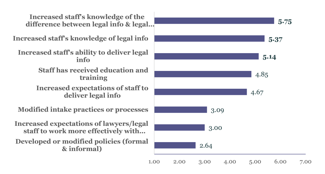
Figure 6: Network Member Survey Results - Changes to Organizations